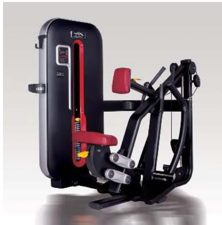
MT-004 Seated Row

Exercise Part:: Back, Teres major Rear Deltoid Biceps Cucullaris